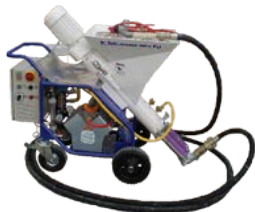
M-tec Mono Mix