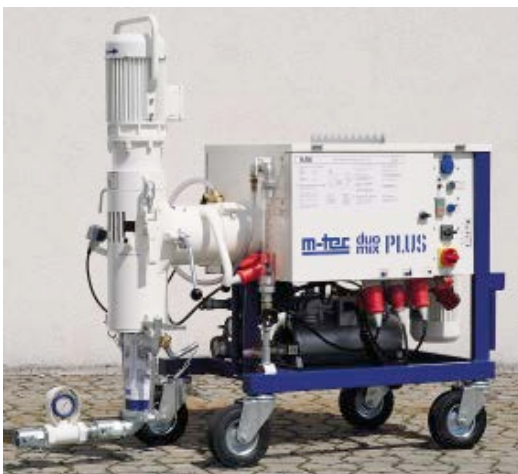
M-Tec Duo Plus